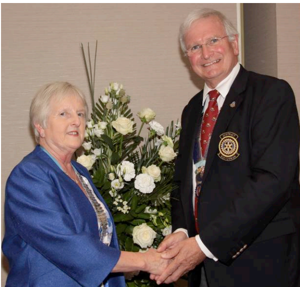
District Chairman Di

The event was extremely well organized, the occasion witnessed by a capacity audience by ladies of Inner Wheel.