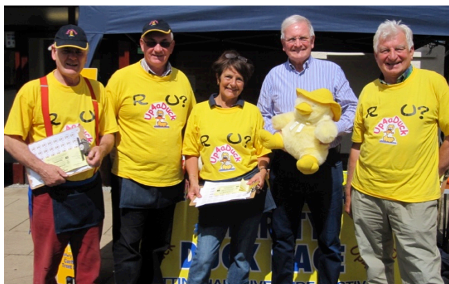
A happy band of ticket sellers

Shortly after 3.30pm on a Sunday afternoon, the ducks took flight before landing on the Trent avoiding any obstacles which may have impeded their journey to the finish. Over £8000 was raised which will be given to local charities at the clubs discretion.