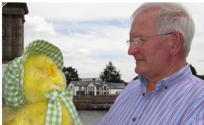
Getting to know the locals