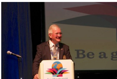
Opening the 44 th District Conference, Southport