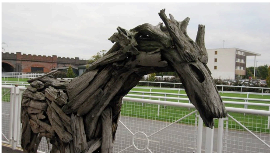
A wood sculpture at the entrance to the Conference Centre