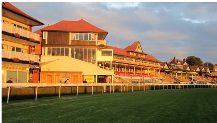
Rotary District 1180 Conference took place at Chester race course

I was pleased to attend 2 District Conferences 1180 and 1270 as a visiting District Governor. In addition to being invited as a speaker at 1260 Conference in Torquay early next year.