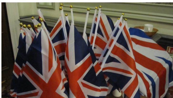
Flags at the ready