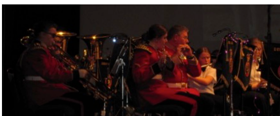
Band members in concert

A big thank you to the members of Long Eaton for organising this splendid concert which has now established itself as a much anticipated event.