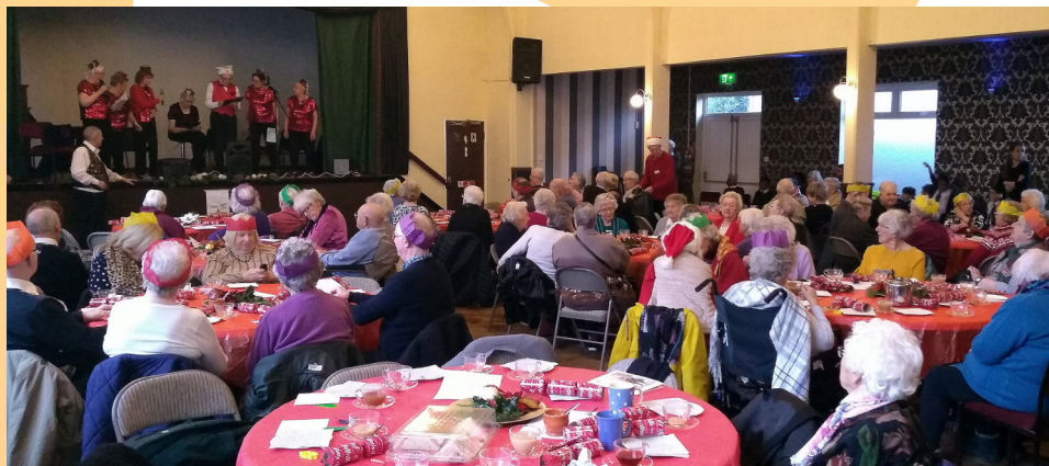
The 2019 Live at Home tea party at the Polish Club

On 13th December 2019 the Rotary Club of Derby gave a Christmas Tea Party at the Polish Club to about 75 elderly Derby-based guests from the Live-at-Home organisation and the Hardy Group. This was the 6 th successive year that this event has been held. It was supported this time by grants from ASDA and the Bring Joy Foundation, which together covered all the costs of the event, for which many thanks have been given. About 27 volunteers assisted including some non-Rotary friends who formed the catering team. The guests were chauffeured by bus, taxi and by cars driven by Rotary members. Entertainment was supplied by the Madeley Players and the choir of the Emmanuel School. A delicious tea was served, with Rotary members acting as waiters. The afternoon was rounded off with a carol sing-along.