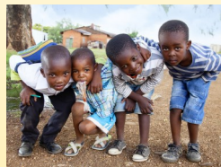
Share Our Updates