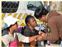
Show Your Support

They work across Africa and India to provide free quality health resources to people who would otherwise fall between the cracks to critical care.