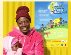
See Lives Changed

They are working to provide critical screening, testing and referrals to citizens who otherwise would not receive access to care. If you or your Club share their passion to bridge the gap between the vulnerable people groups and quality medical care, then they would love to have you commit your support by signing up to be a RFHA Health Hero (free member of our Rotarian Action Group).